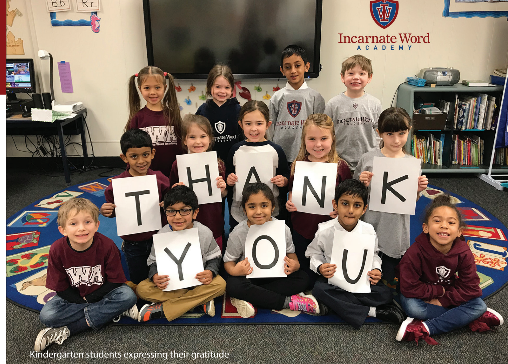
Kindergarten students expressing their gratitude