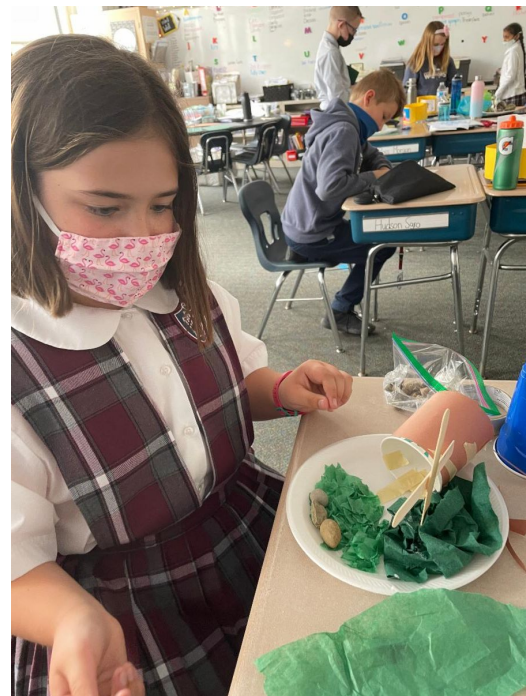
Third graders made a craft which depicted the tomb where Jesus was buried.