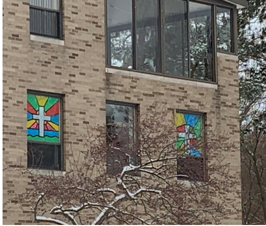
Prep Academy students created beautiful stained glass windows!