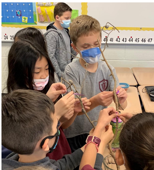
Second graders participating in our Holy Week prayer service.