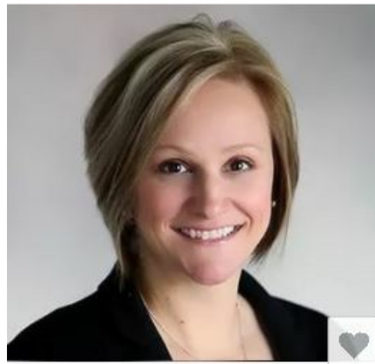
Principal for the Day Give an IWA student the chance to play principal!

Are you ready for Warrior Weekend? It all kicks off tonight! Together, we are WARRIOR STRONG!