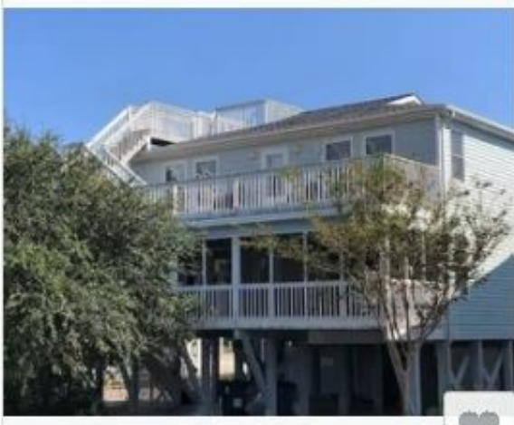
Beach Home Vacation! Sunset Beach, North Carolina- 7 night stay