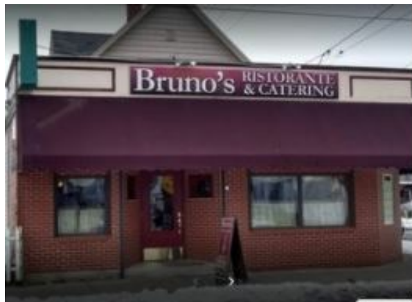
Chef's Dinner for Four Bruno's Ristorante in Ohio City